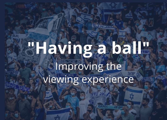
"Having a ball" Improving the viewing experience