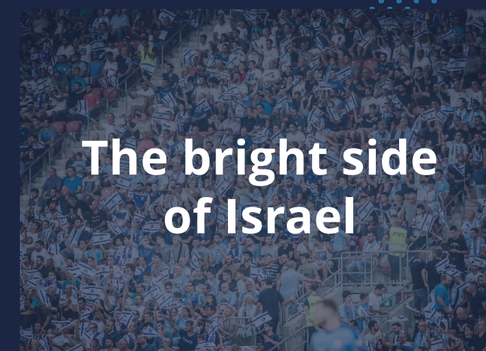
The bright side of Israel