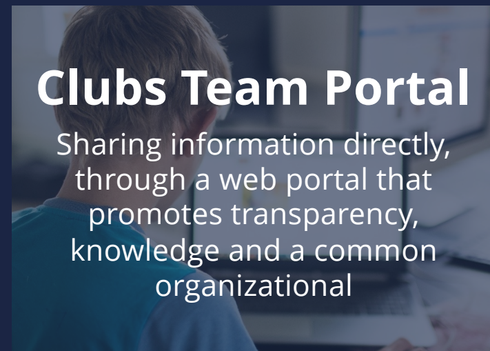
Clubs Team Portal Sharing information directly, through a web portal that promotes transparency, knowledge and a common organizational