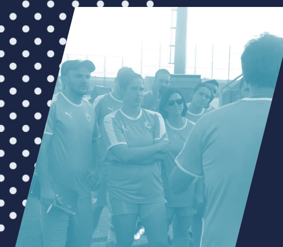
Training & coaches