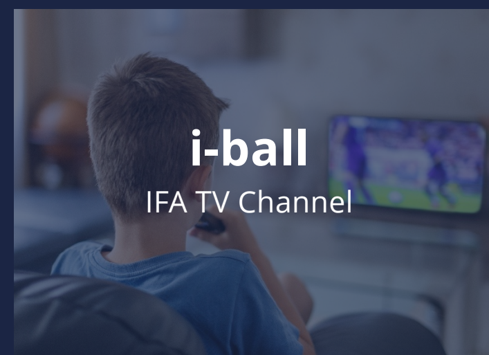
i-ball IFA TV Channel