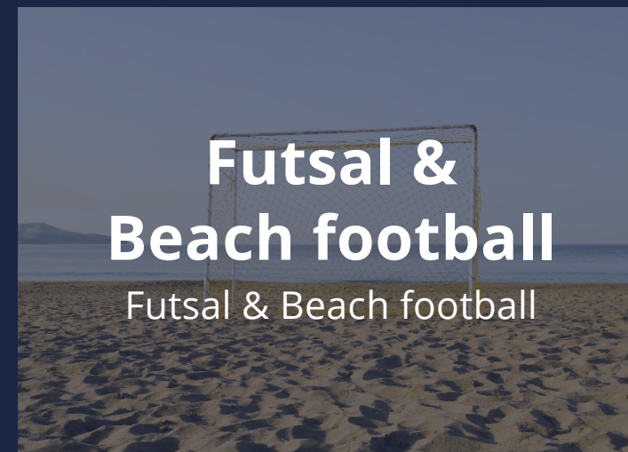
Futsal & Beach football Futsal & Beach football