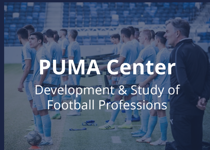
PUMA Center Development & Study of Football Professions