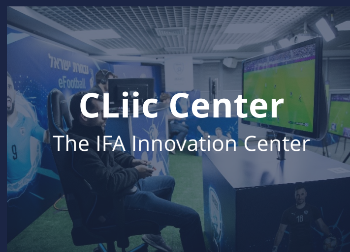
CLiic Center The IFA Innovation Center