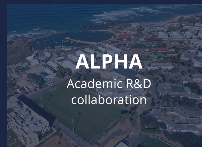
ALPHA Academic R&D collaboration