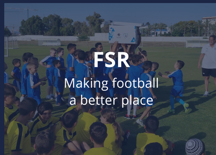
FSR Making football a better place