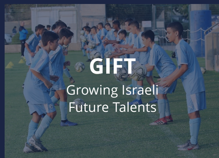
GIFT Growing Israeli Future Talents