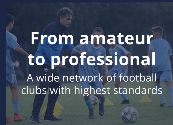
From amateur to professional A wide network of football clubs with highest standards