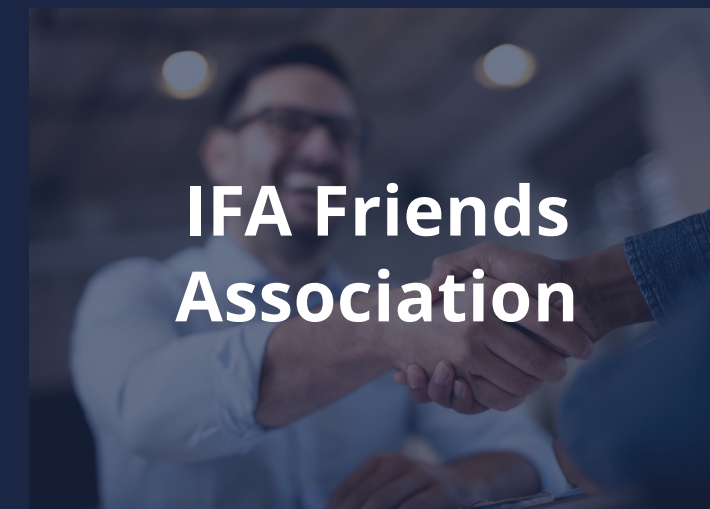
IFA Friends Association